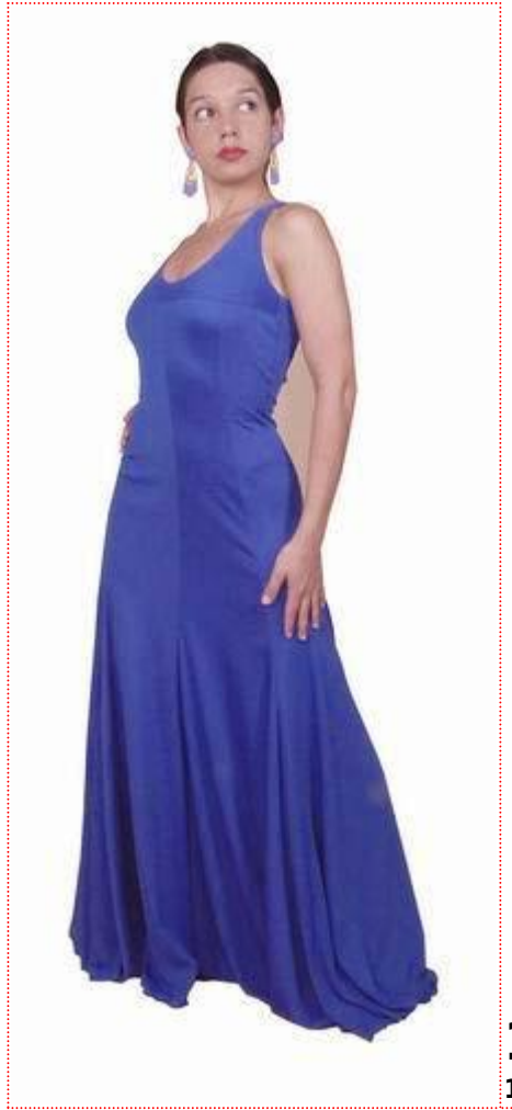
157.75 € 169.93 USD