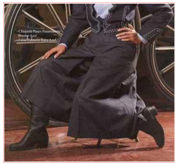
82.65 € 89.75 USD